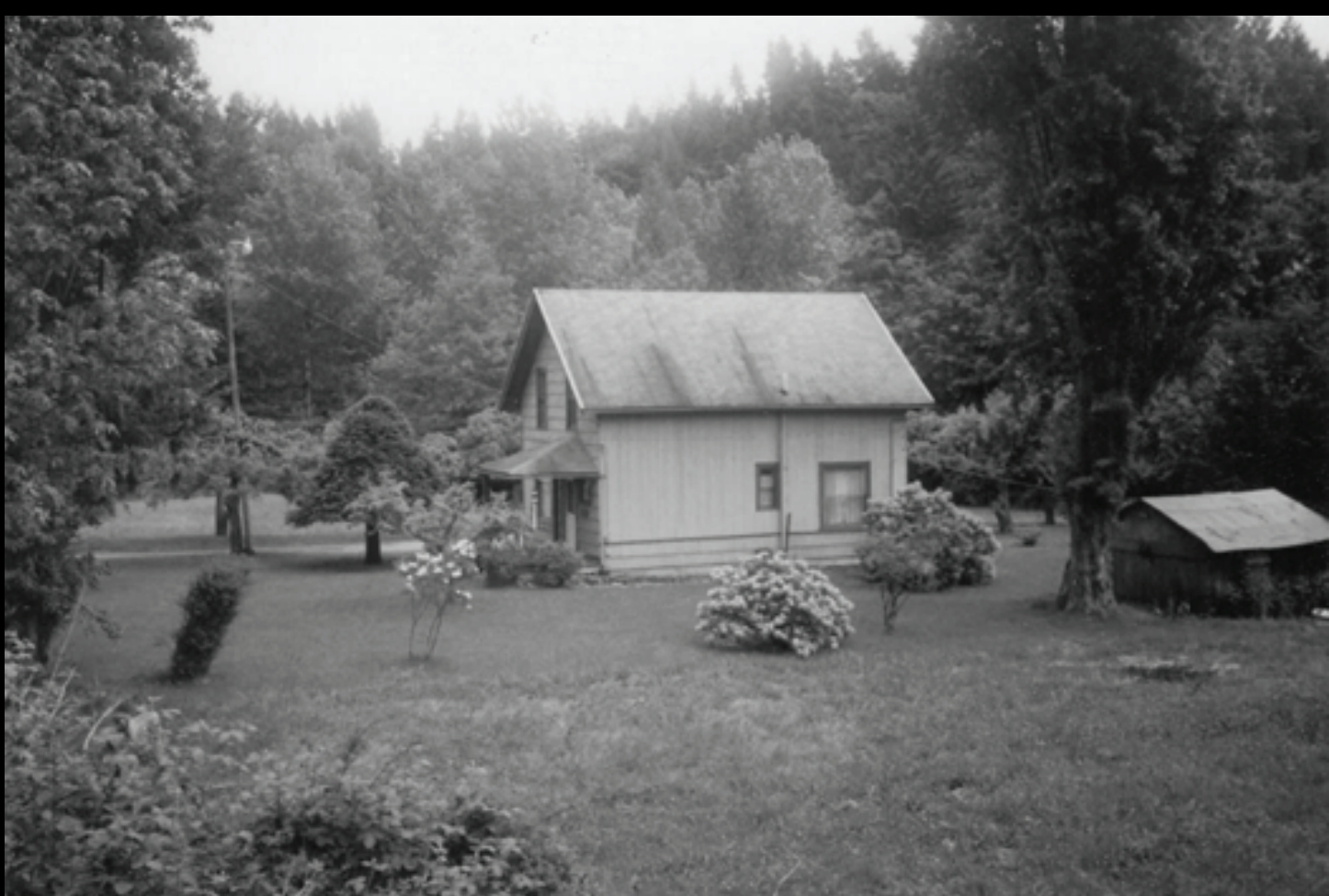
The Frazier house was formerly one of two buildings used as a bunkhouse for workers at the shingle mill at the top of Victor Falls.