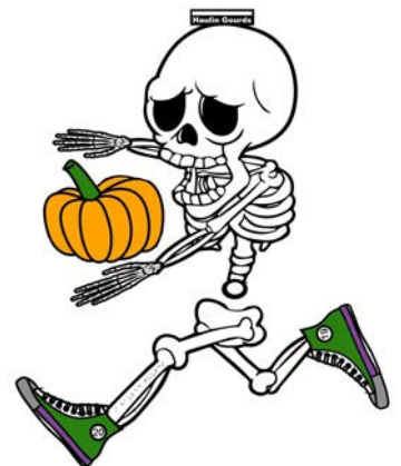
Haulin' Gourds 5k October 19

Race details and registration available online at RaceEntry.com