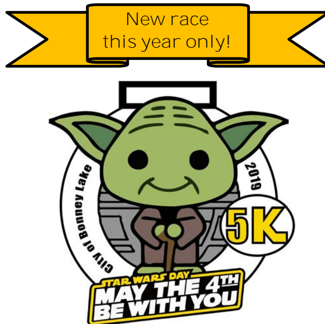
Star Wars Day 5k May 4