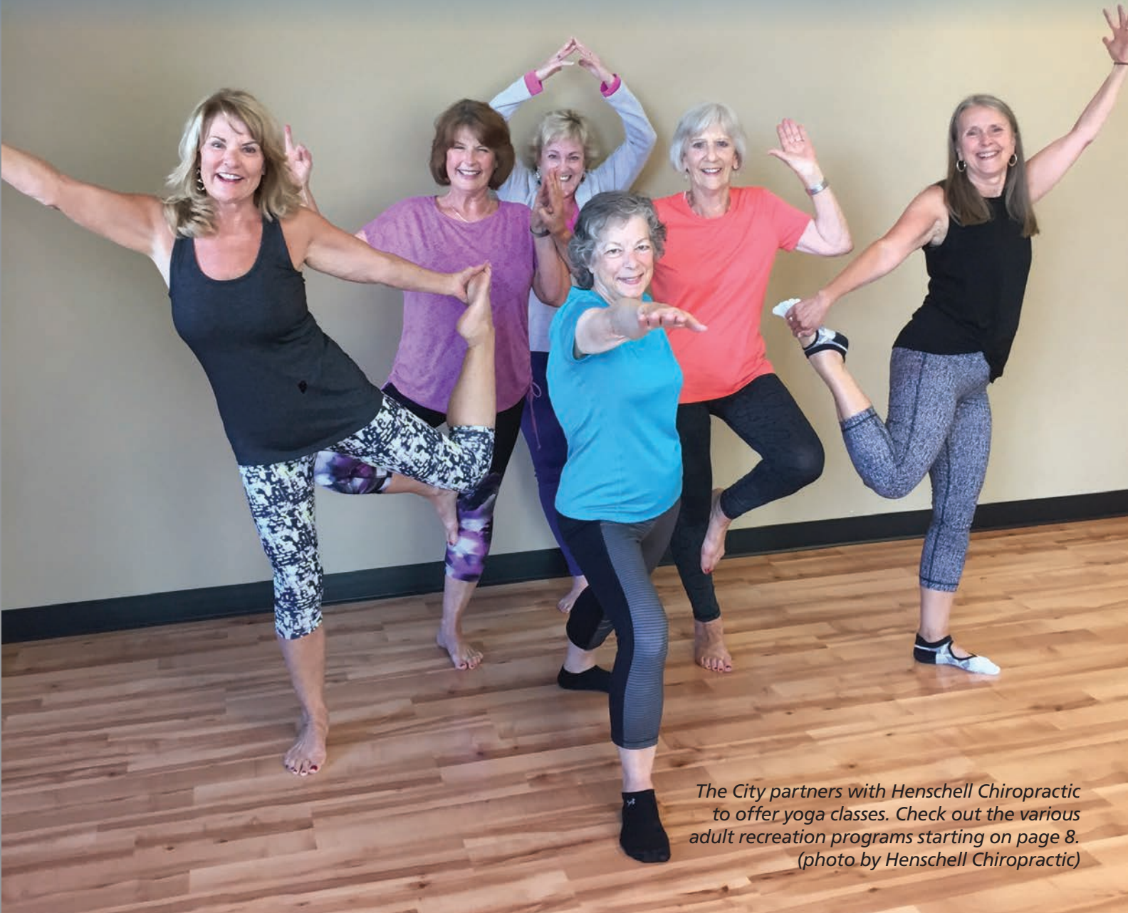
The City partners with Henschell Chiropractic to offer yoga classes. Check out the various adult recreation programs starting on page 8.

Spring 2019 Issue: Recreation Guide p. 4 City News p. 11