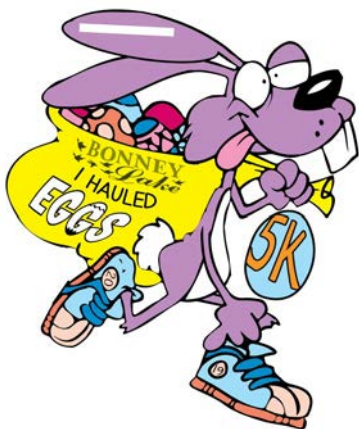
Haulin' Eggs 5k April 20

Strap on your running shoes and register for the City of Bonney Lake's 5k Fun Runs